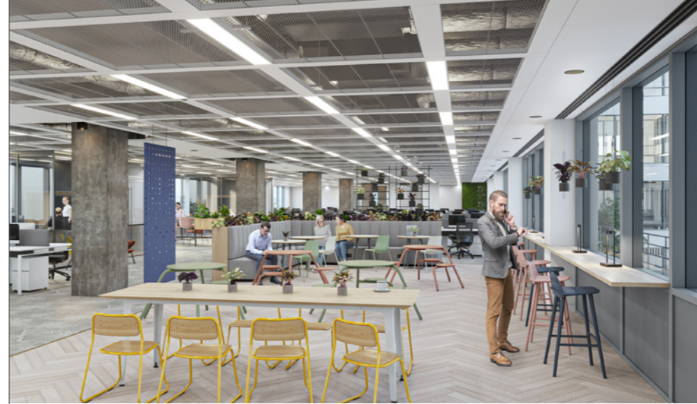
▲ First Floor CAT B CGI