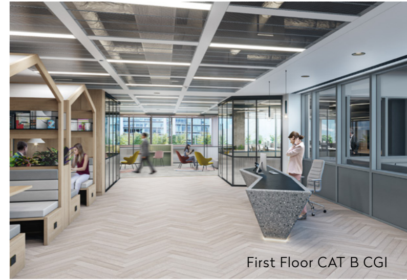
First Floor CAT B CGI

Part First Floor 12,841 SQ FT / 1,193 SQ M